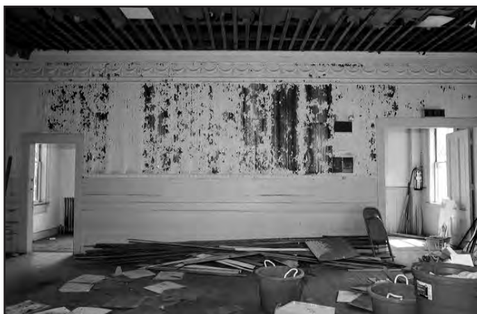
The second floor of the Athenaeum. The original tin wall appears beneath the peeling paint.

For more information or to volunteer, visit www.Saxonville.org or contact Jan Harrington at 508.877.0520 or giftbk@aol.com ♦