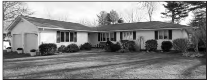
Campanelli Ranch on Leonard Road, Framingham.