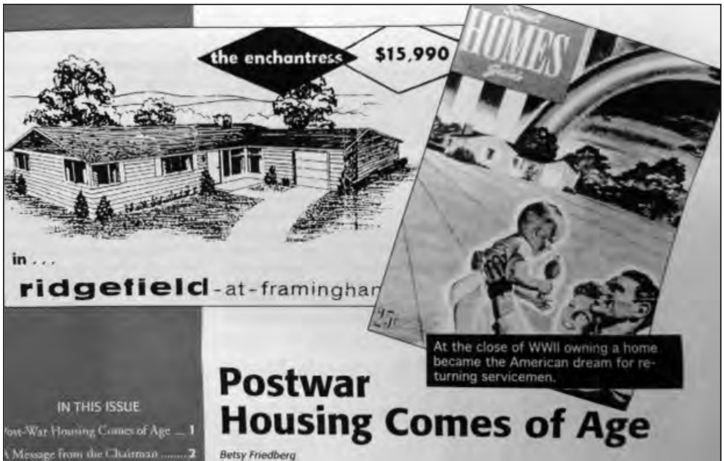
Cover image from Preservation Advocate , Spring 2003 edition.

Builders such as Campanelli quickly responded to the emerging ideal, and capitalizing on the availability of GI Bill financing for veterans, built more than 8600 single family homes in eastern Massachusetts. Neighborhoods in Framingham such as Longfield, Pinefield, Ridgefield, Woodfield and others allowed young