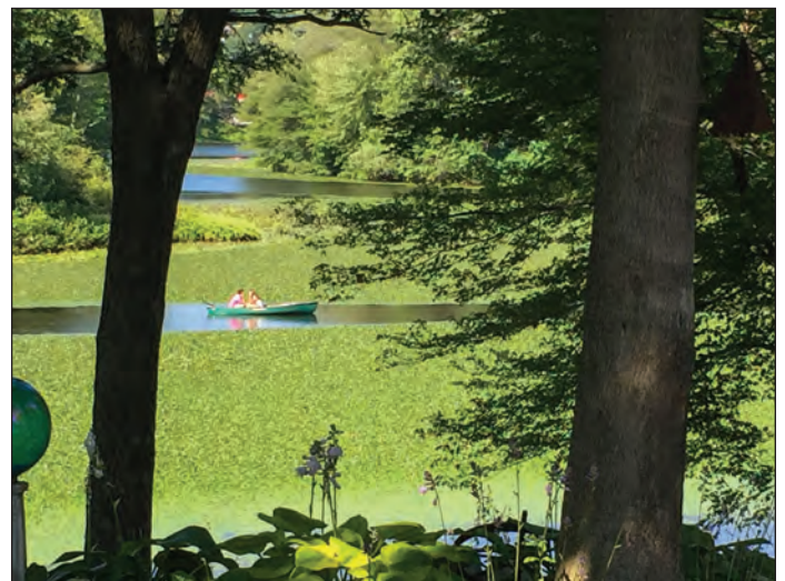
Water Chestnuts clogging the Sudbury River just west of the Saxonville Dam in Summer 2015

cucina with fireplace and children's play area. Residents have a 24-hour maintenance emergency service guarantee. Immediate move-ins are available. This pet-friendly community participates in the WAG (Welcome, Appreciate, Give) Program, with charitable efforts contributed to the Humane Society. Common areas include a WAG Dog Park and green spaces. www.AvalonFramingham.com . ❖