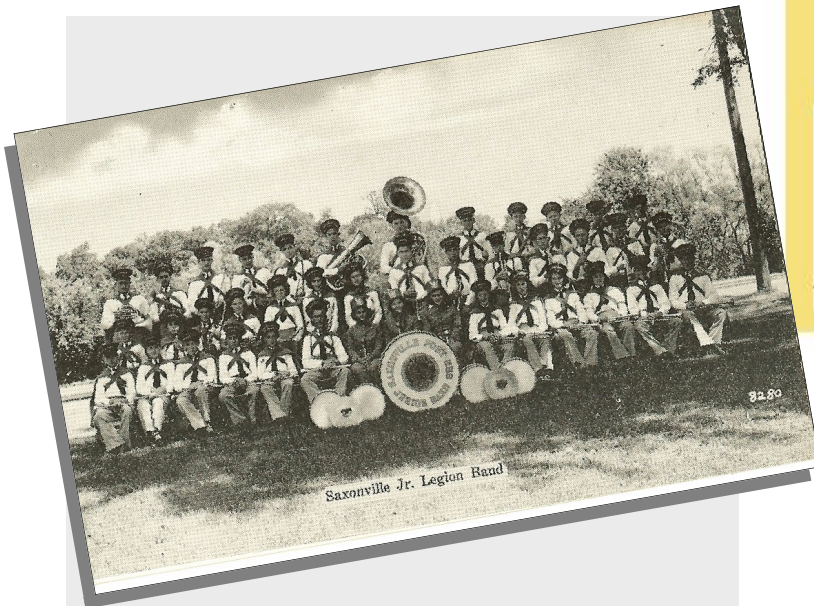
Saxonville Jr. Legion Band